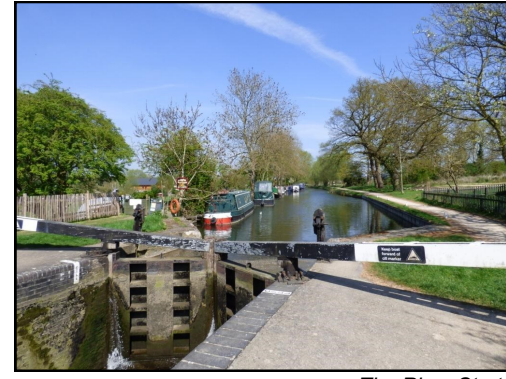
The River Stort

This walk is approximately 5 miles long and will take about 2 hours to complete.