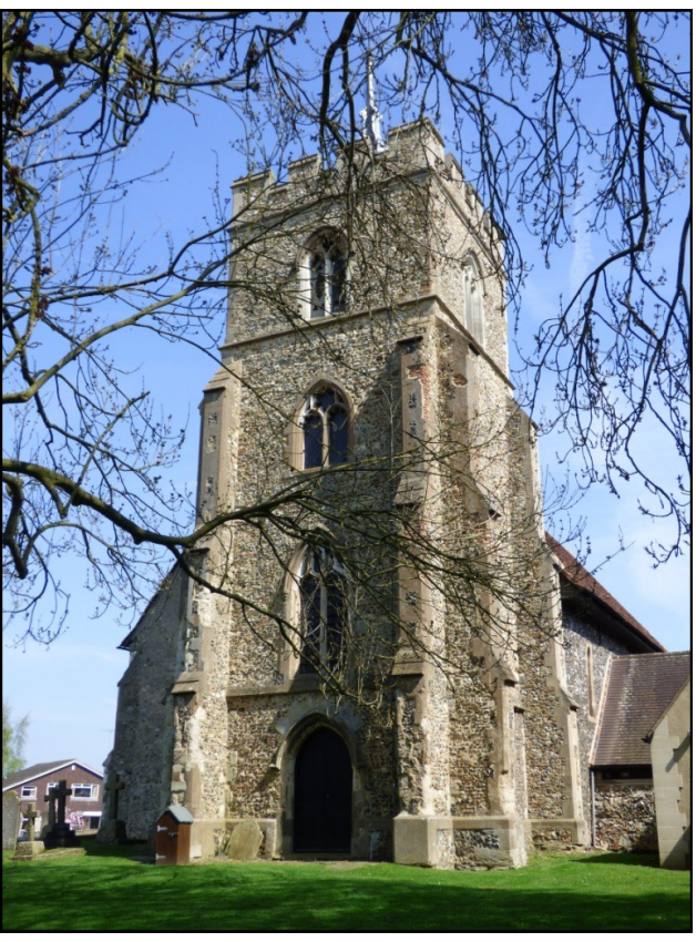
St Peter's Church