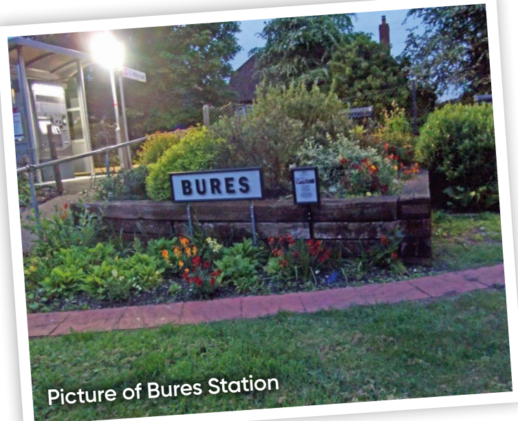
Picture of Bures Station